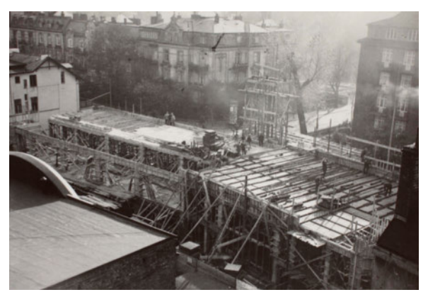
Construction of the new administration building, 1935/36

Around 40 years previously, there had been no sign whatsoever of the major social catastrophes that would befall Eimsbüttel. From 1900 onwards, advancing industrialization meant that the borough's magnificent buildings were joined by more and more