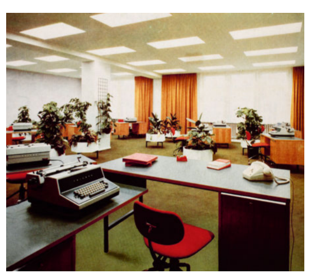
The central typing pool in 1967: The digital age has yet to arrive in the office.

The growing use of modern office machines also changed work processes and structures at Beiersdorf. To begin with, however, modern IT technology was confined to the computer center. Paper files, rubber stamps, dial phone, and typewriter – these were the items typically found on a 1970s desk. Little by little, however, electronic data processing began to gain ground. In the fall of 1970, 16 people at Beiersdorf were given instruction in using desktop computers – by today's standards these were little more than basic calculators capable of printing, and were as large as typewriters. The days of totting up figures were over and the days of delegating everyday office work to a computer had begun.